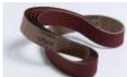
VSM CK748X COMPACTGRAIN