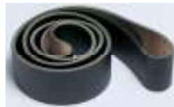
VSM CK721X / CK721J