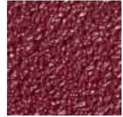
VSM Compactgrain P400

The single abrasive grain of Compactgrain granulate performs the stock removal. Once a grain is worn, it breaks away from the granulate exposing a new, sharp grain to start to grinding.