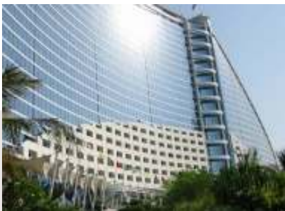
Facing of Buildings