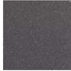
Standard Silicon Carbide P400